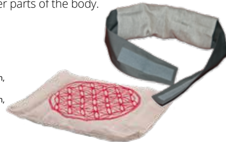
Shungite belt, waist length 120-140 cm, SKU No.: 085 (without picture)