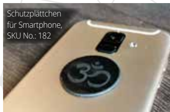
Schutzplättchen für Smartphone, SKU No.: 182