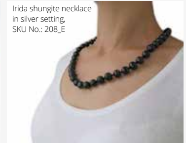
Irida shungite necklace in silver setting, SKU No.: 208_E

Shungite also goes well with other curative stones. Such protection not only looks very attractive but also combines the effect of curative stones, e.g. in the form of a bracelet with shungite and amber.