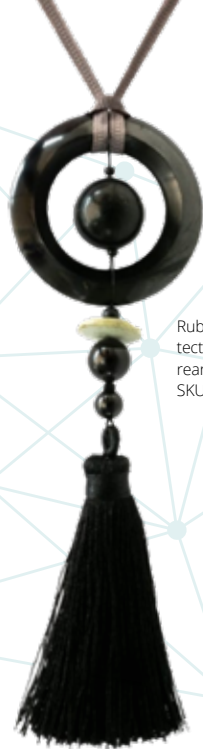
Rubreck car protective amulet for rear-view mirror, SKU No.: 277

Today, as it was in the past, shungite is a powerful amulet that offers us protection, both at home and on the road.