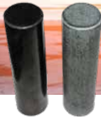
Shungite and talc chlorite set, polished, SKU No.: 073

Shungite and talc chlorite cylinders are used to harmonize the yin and yang forces. The shungite cylinder symbolizes the female yin energy, the talc chlorite cylinder embodies the male yang energy.