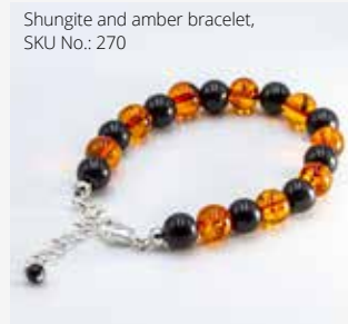
Shungite and amber bracelet, SKU No.: 270