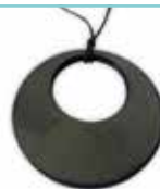
Eystone necklace, SKU No.: 042_E