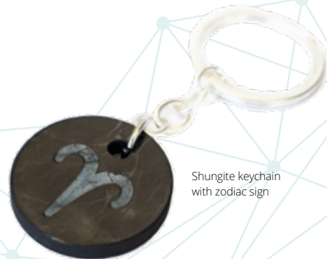
Shungite keychain with zodiac sign

Shungite is a strong protective stone. Its size is of secondary importance. The stone can efficiently provide protection already as a protective amulet on keys or on a bag. Shungite as a keychain or travel pendant is ideal for everyday life.