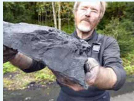
Here is one of our business partners with a sample of shungite stone.

All shungite offered on www.schungit.com comes from Zaonezhskaya oblast in Karelia (Russia).