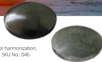
Lenses for harmonization, polished, SKU No.: 046

Shungite and talc chlorite cylinders are used to harmonize the yin and yang forces. The shungite cylinder symbolizes the female yin energy, the talc chlorite cylinder embodies the male yang energy.