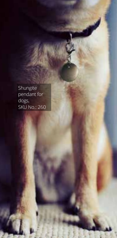
Shungite pendant for dogs, SKU No.: 260