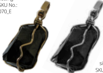
Elite shungite necklace in gold setting SKU No.: 070_E